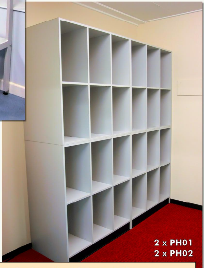
2 x PH01 2 x PH02